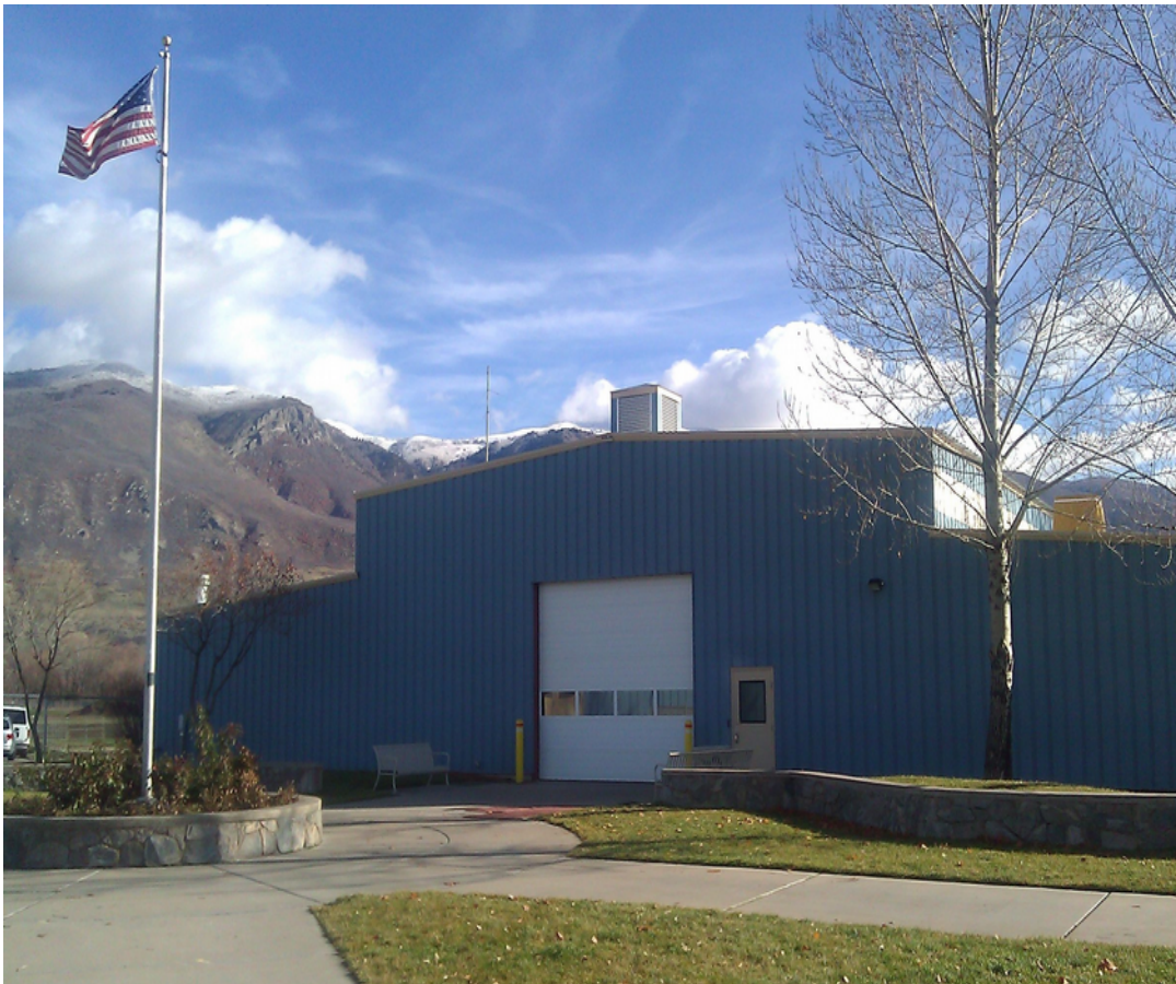
Building #2, the site of the Utah VHF Society swap meet