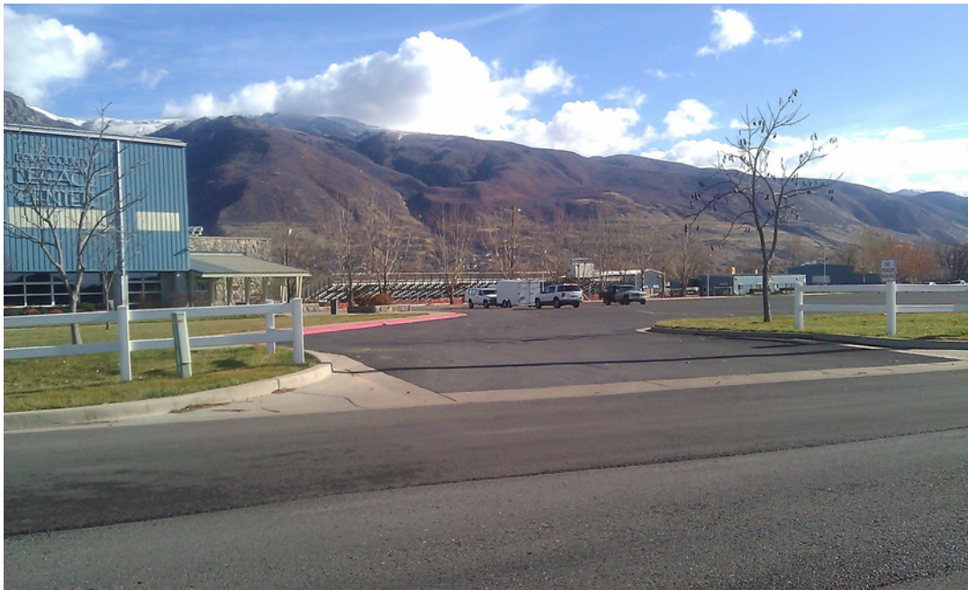
One of the parking lot entrances along 1100 West